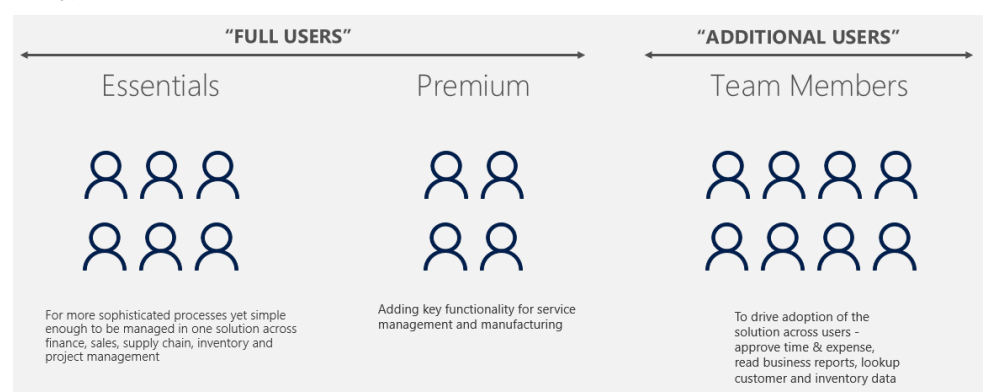
Figure 3: user Types

Full Users receive unrestricted direct or indirect access to all of the functionality in the licensed server software including setting-up, administering, and managing all parameters or functional processes across the ERP Solution. Full Users require more write capabilities that those available to Team Members.